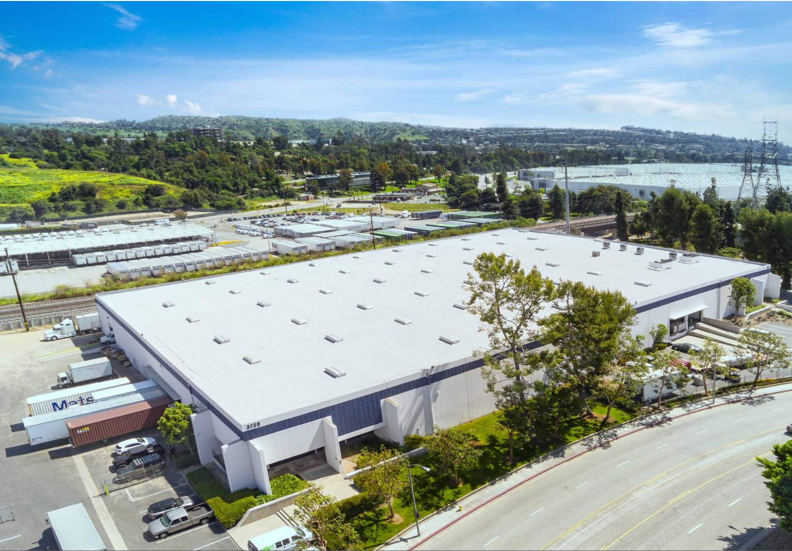
2720 Pellissier Place City of Industry CA 90601